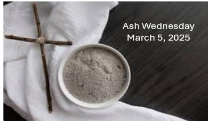
Ash Wednesday March 5, 2025