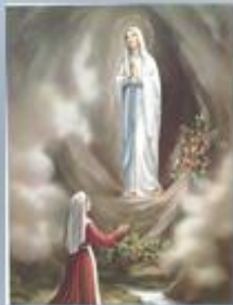
Our Lady of Lourdes ~ February 11 th