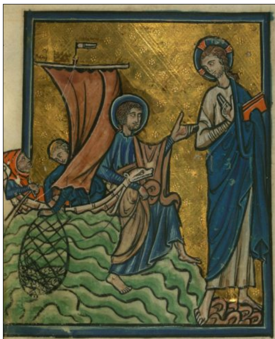
Christ Appears at Lake Tiberias, William de Brailes, c. 1250

Acts 5:27–32, 40–41 Psalms 30:2, 4–6, 11–13 Revelation 5:11–14 John 21:1–19