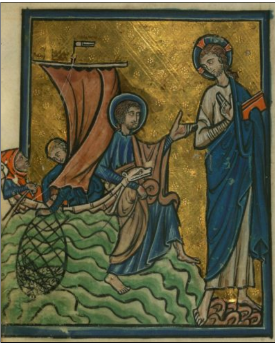
Cristo en el lago Tiberíades, William de Brailes, c. 1250

Hechos 5,27–32.40–41 Salmo 30,2.4–6.11–13