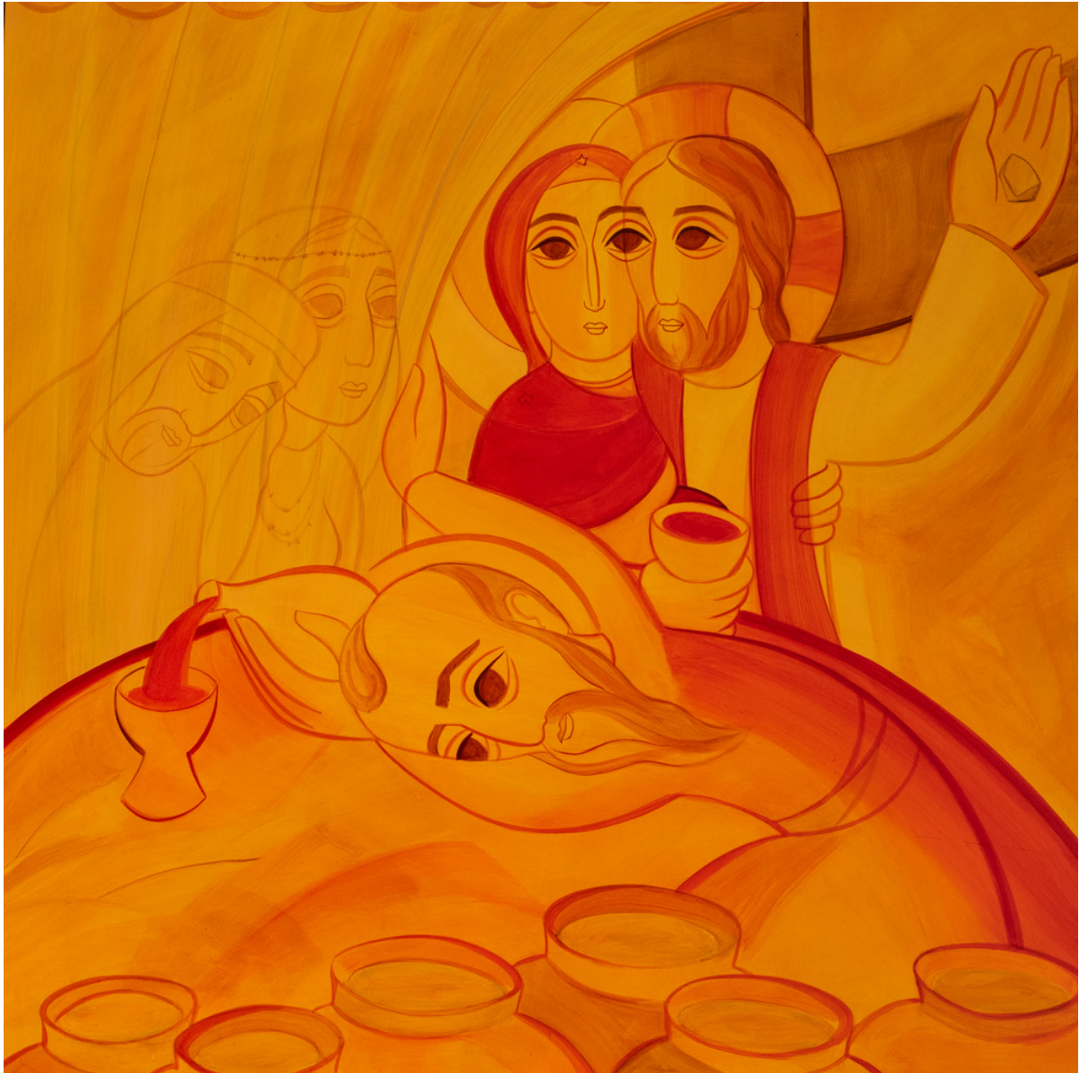
World Meeting of Families 2022

Theme: "Family Love: a Vocation and a Path to Holiness"