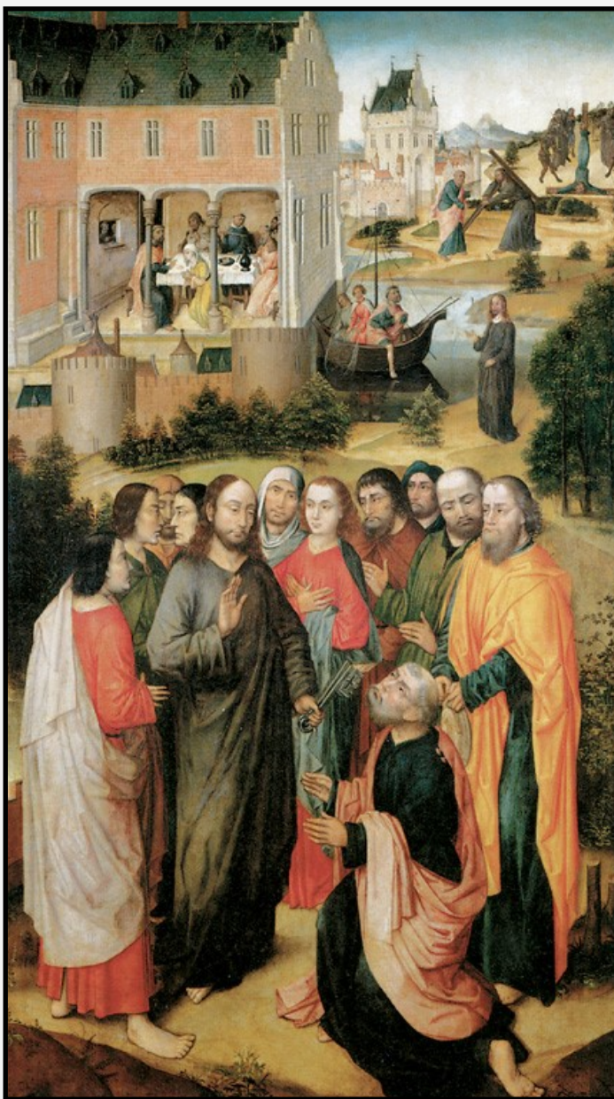
Christ Handing the Keys to St. Peter

Then he strictly ordered his disciples to tell no one that he was the Christ.