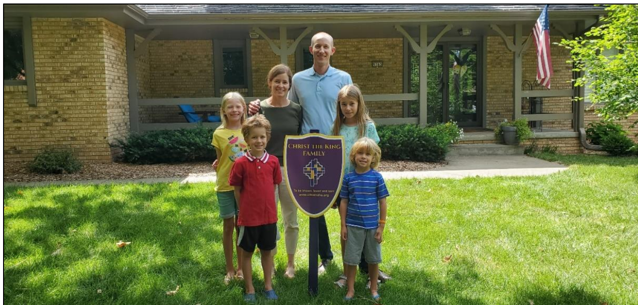
The Walker family proudly displays a sample of our new Christ the King Family yard signs

We are pleased to offer new Christ the King Family yard signs at a cost of only $15.00! Show your Christ the King spirit and stand in solidarity with fellow parishioners by purchasing and erecting one of these lovely, sturdy signs in your yard or garden area. It's an easy way to bring awareness of our community to neighbors, to start a conversation, and to gently invite others to visit or join us.