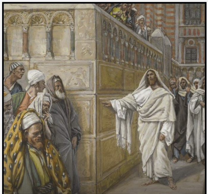
The Cornerstone by Jacques-Joseph Tissot, French, 1836-1902

Jesus said to them, "Did you never read in the Scriptures: The stone that the builders rejected has become the cornerstone; by the Lord has this been done, and it is wonderful in our eyes? Therefore, I say to you, the kingdom of God will be taken away from you and given to a people that will produce its fruit."