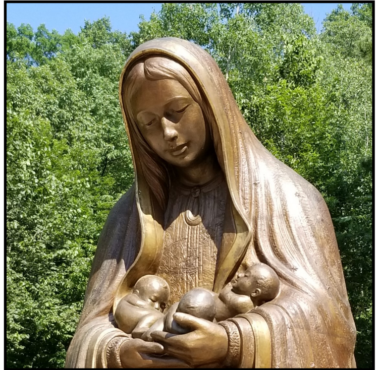
Bronze statue of Our Lady of Guadalupe, Patroness of the Unborn, at her shrine in La Crosse, WI

Considering the eugenicist and outright racist views of the founder of Planned Parenthood, Margaret Sanger, it is impossible to think that abortion isn't being used as a deliberate tool to exterminate minorities.