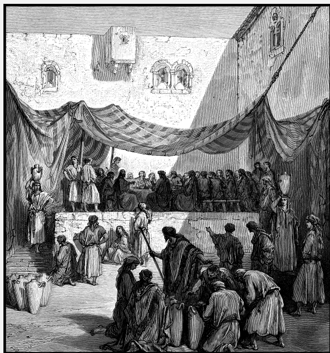
The Marriage of Cana by Gustave Doré

The servants went out into the streets and gathered all they found, bad and good alike, and the hall was filled with guests."