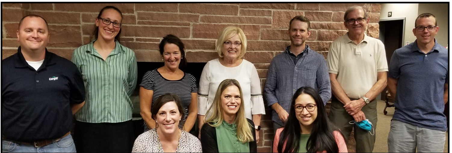
2020-2021 Members of the Christ the King Pastoral Council