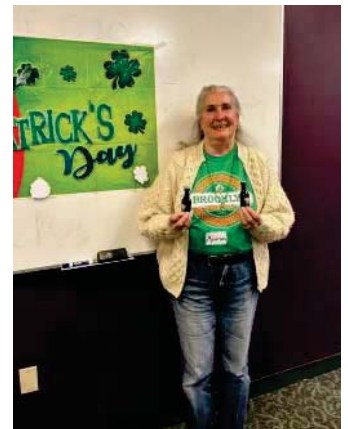
Parishioners join in for the St. Patrick's Day Pot Luck on March 11th.

The Reading Food Pantry is a project of the entire Reading community, housed at Old South Church, 6 Salem Street, Reading. Drop off time is Wednesdays, 4:30-6:00 pm at the back door.