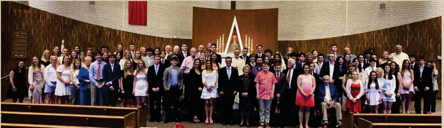
Newly Confirmed with Sponsors at the Saturday, May 13th Confirmation Mass.