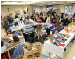
42 Unique Craft Vendors

ST. ANDREW CRAFT & CHILDREN'S FAIR Saturday, November 4, 2023 – 9am-2pm