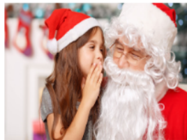
Photos with Santa