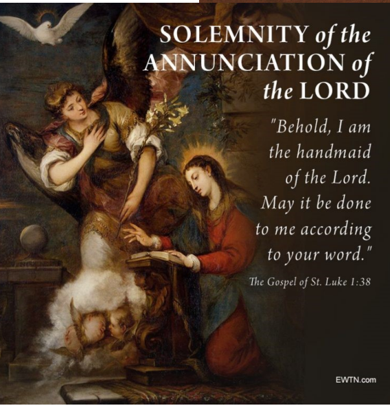
Solemnity of the Annunciation of the Lord Feast Day Mass Friday, March 25 at 9 a.m.

Lenten Penance Service / Servicio de Penitencia Cuaresmal