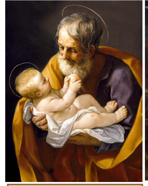
Solemnity of St. Joseph Feast Day Mass Saturday, March 19 at 8 a.m.