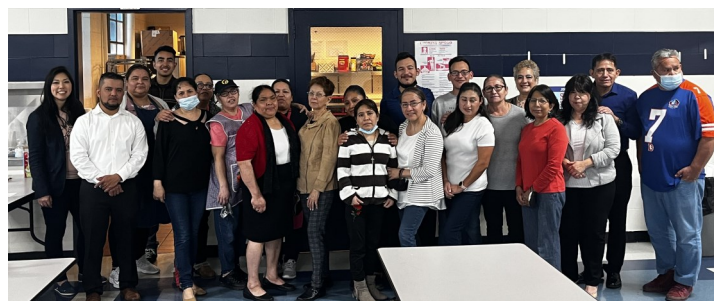
Gracias! —Coro y el grupo de oracion

Comenzará el Jueves, 19 de Mayo a las 5:30 pm en el Auditorio Terminará el Domingo, 22 de Mayo con la Misa de las 12:00 pm