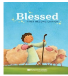
1st Reconciliation 1st Communion