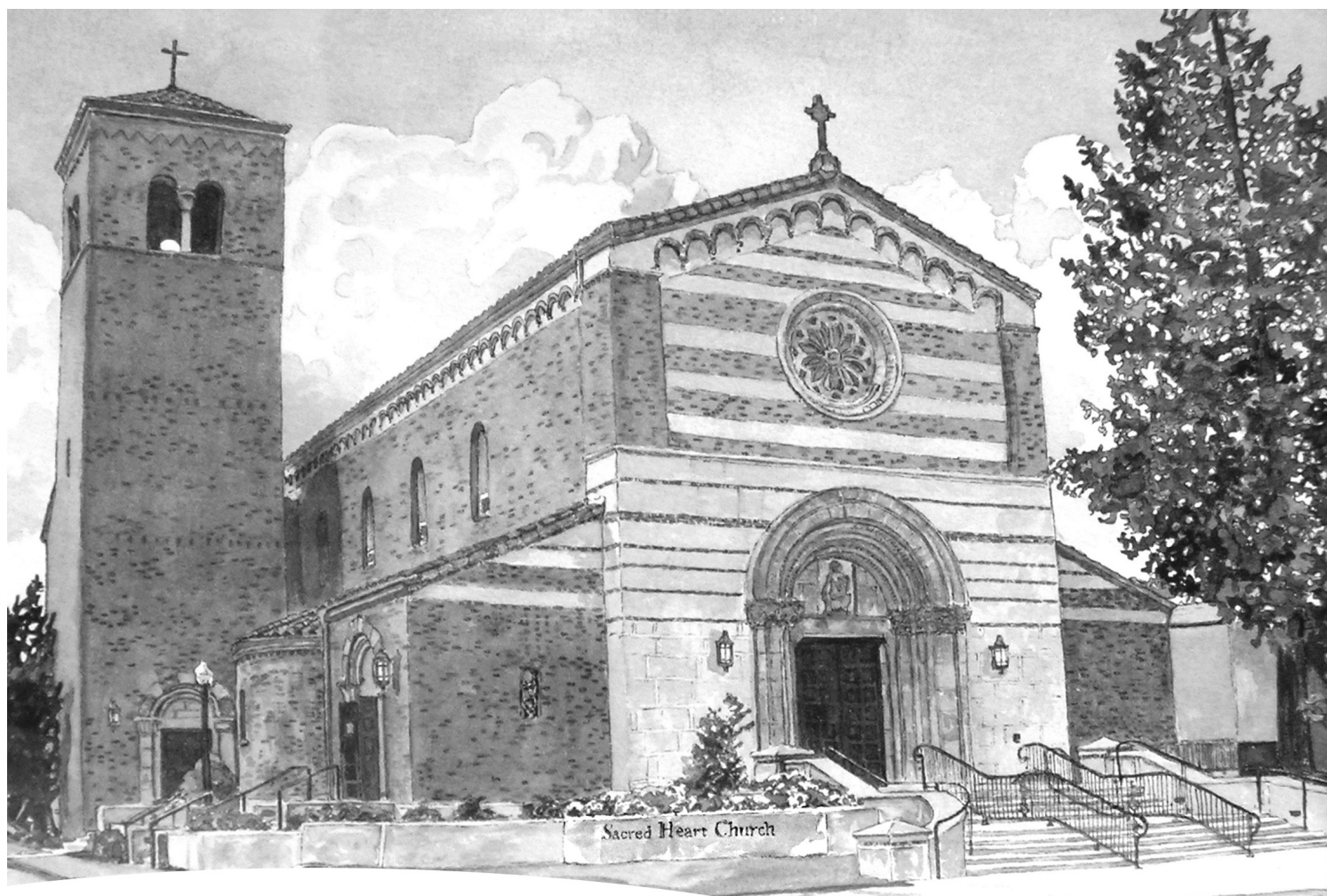
ILLUSTRATION BY PATT ILLOULI