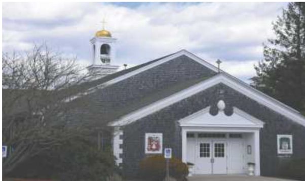
St. Elizabeth Seton