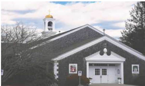
St. Elizabeth Seton