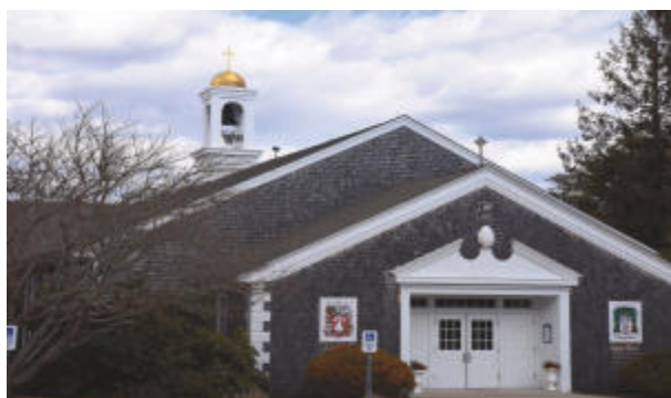
St. Elizabeth Seton