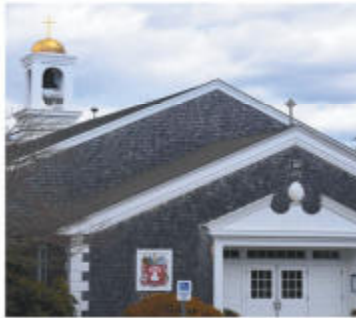
ST. ELIZABETH SETON