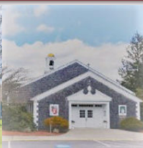
ST. ELIZABETH SETON