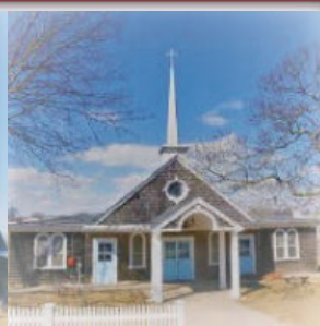
ST. THOMAS CHAPEL

Main Office Address: 167 East Falmouth Hwy., East Falmouth, MA 02536