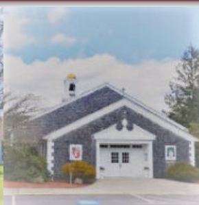
ST. ELIZABETH SETON