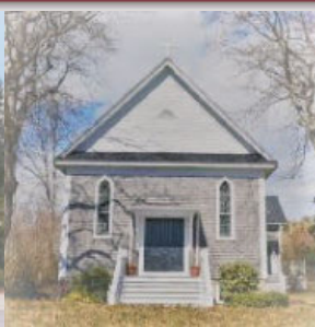
ST. JOSEPH CHAPEL