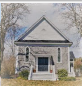
ST. JOSEPH CHAPEL