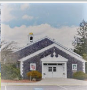
ST. ELIZABETH SETON