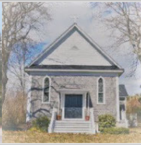
ST. JOSEPH CHAPEL