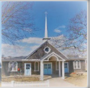
ST. THOMAS CHAPEL

Office Address: 167 East Falmouth Hwy., East Falmouth, MA 02536