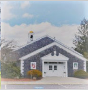
ST. ELIZABETH SETON