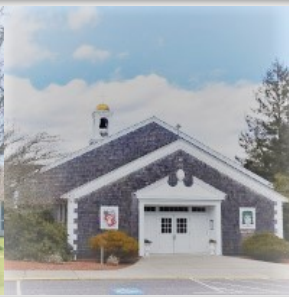
ST. ELIZABETH SETON