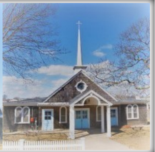
ST. THOMAS CHAPEL

Office Address: 167 East Falmouth Hwy., East Falmouth, MA 02536