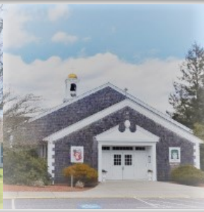
ST. ELIZABETH SETON