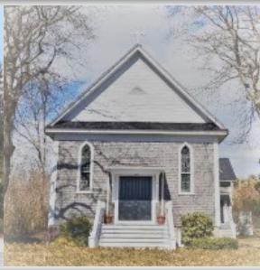
ST. JOSEPH CHAPEL