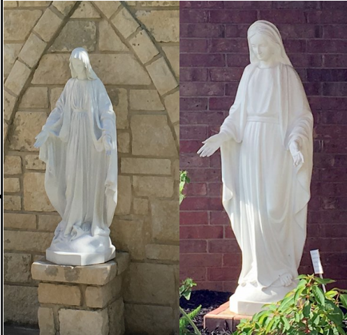
at St. Charles