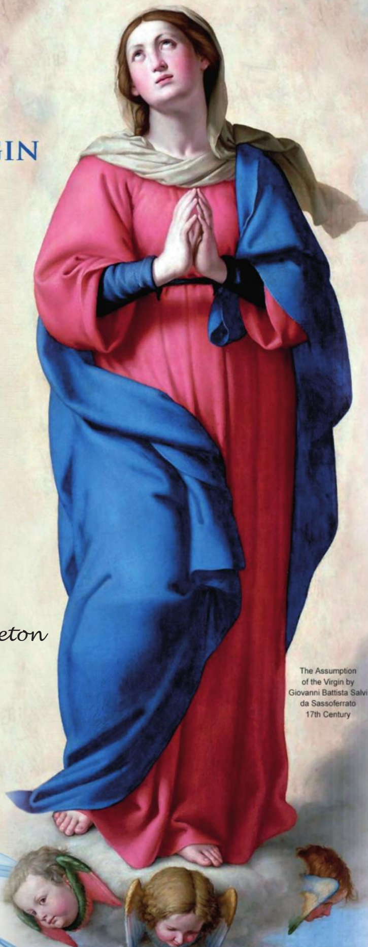
The Assumption of the Virgin by Giovanni Battista Salvi da Sassoferrato 17th Century

August 13, 2023 Saint Elizabeth Ann Seton Catholic Church