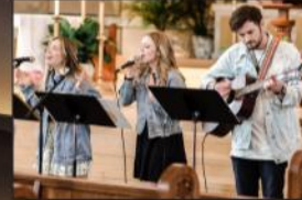
Shema Culture - Thursday, Dec. 21