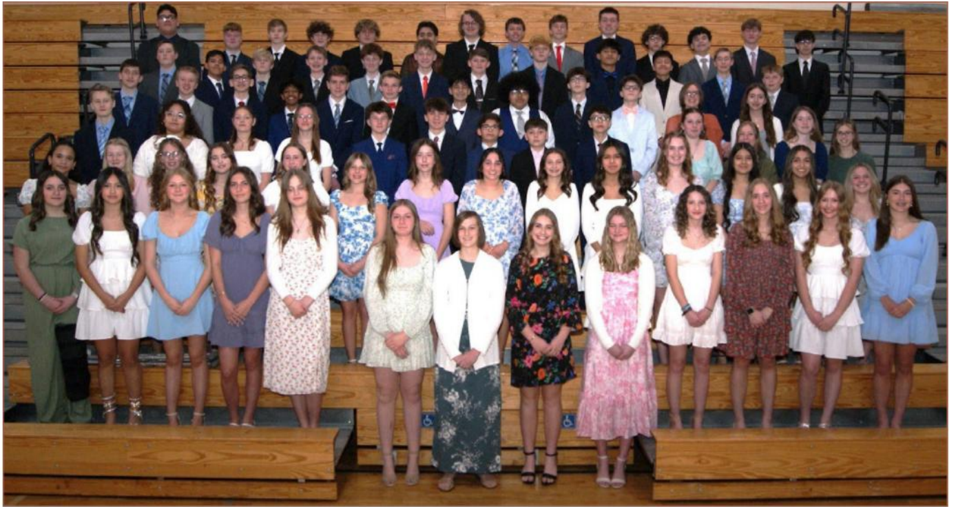
Congratulations to our 2025 Confirmation Class