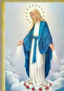
Blessed Virgin Mary

We are ordinary ladies who are proud of reaching out and helping those less fortunate by meeting the needs of the people in their communities and around the world. We are also committed to the preservation of family life. We are an organization that addresses the religious needs of the church and community where we live, worship, work and play.