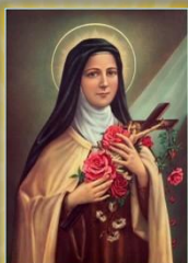
St. Therese, the Little Flower