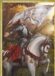
St. Joan of Arc