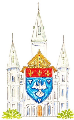
GOD IS FAITHFUL

On March 14 and 15 , the Archdiocese of New Orleans will host a very important second collection to raise funds to offset the costs of educating seminarians at Notre Dame Seminary and St. Joseph Seminary College. All funds collected will go directly to supporting the education and formation of the 23 men currently studying to be priests in the Archdiocese of New Orleans. The annual cost to fund a single seminarian is $45,000, and this total is one of the largest budgetary items in the Archdiocese of New Orleans. Please continue to pray for these men and those who work with them on their priestly formation. Please give generously to this very important fund that will provide monetary support to those men who will minister to the people of God in New Orleans for many years to come.