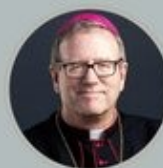
BISHOP ROBERT BARRON