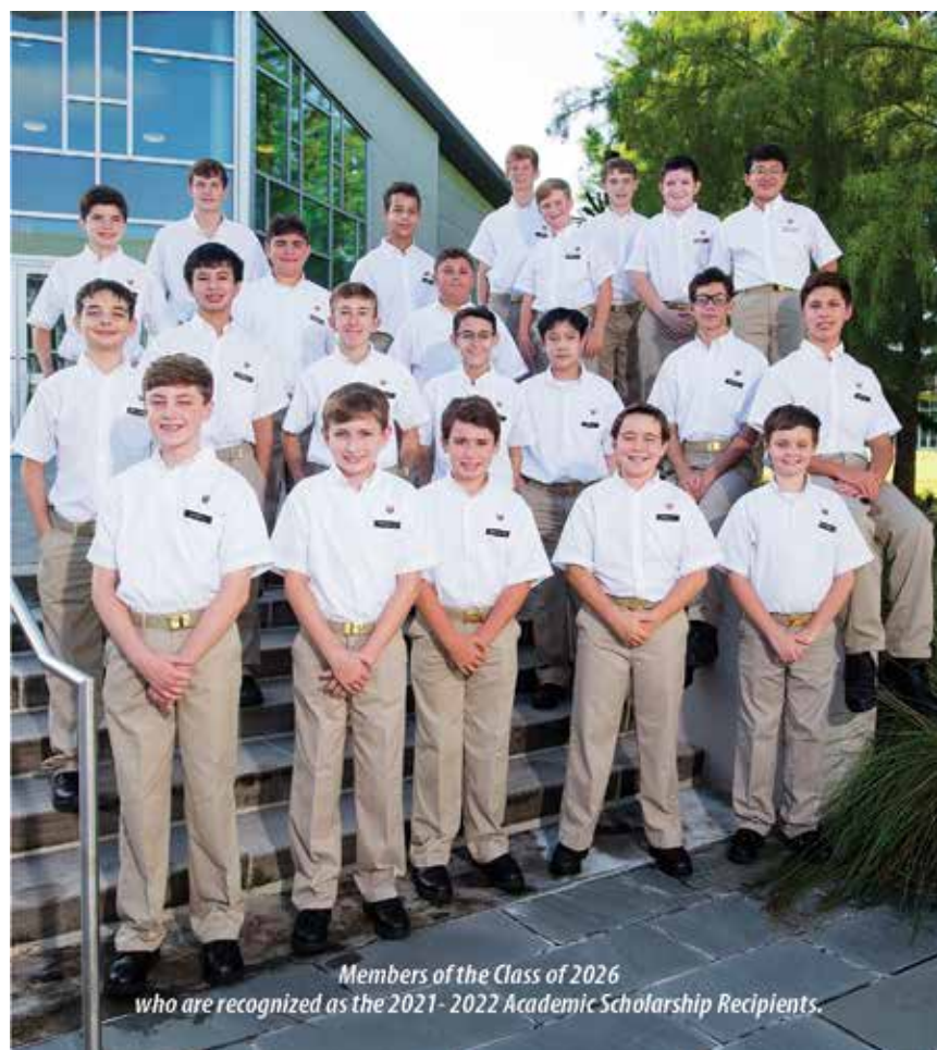
Members of the Class of 2026 who are recognized as the 2021-2022 Academic Scholarship Recipients.

While this experience is See GIRLS' SCHOOLS page 18 ►