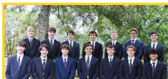
2021 National Merit Semifinalists & Commended Scholars