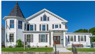
Sitkowski, Malboeuf & Hickey Funeral Home

33 Schofield Ave. Dudley, MA 01571 Phone: (508) 943-6100 Email: bartelmark@charter.net