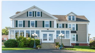
Scanlon Funeral Service