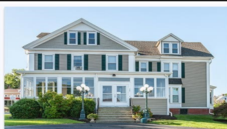
Scanlon Funeral Service