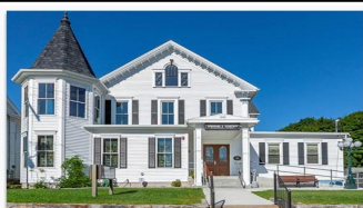
Sitkowski, Malboeuf & Hickey Funeral Home

33 Schofield Ave. Dudley, MA 01571 Phone: (508) 943-6100 Email: bartelmark@charter.net