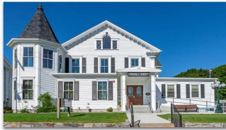
Sitkowski, Malboeuf & Hickey Funeral Home

33 Schofield Ave. Dudley, MA 01571 Phone: (508) 943-6100 Email: bartelmark@charter.net