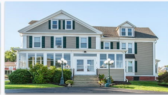
Scanlon Funeral Service