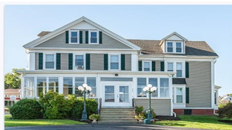
Scanlon Funeral Service