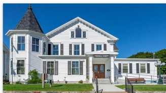
Sitkowski, Malboeuf & Hickey Funeral Home

33 Schofield Ave. Dudley, MA 01571 Phone: (508) 943-6100 Email: bartelmark@charter.net