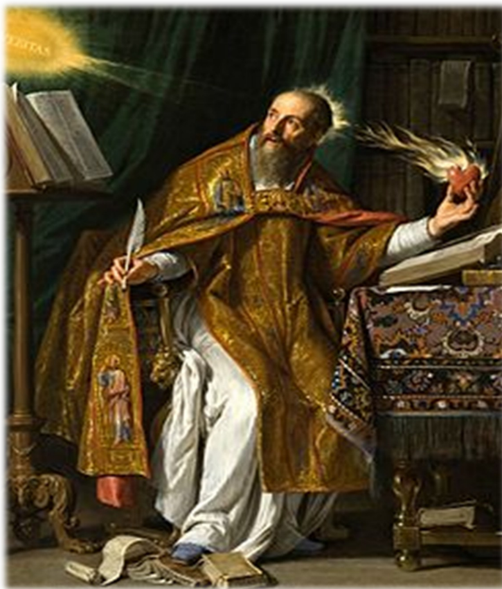
St. Augustine, Doctor of Grace