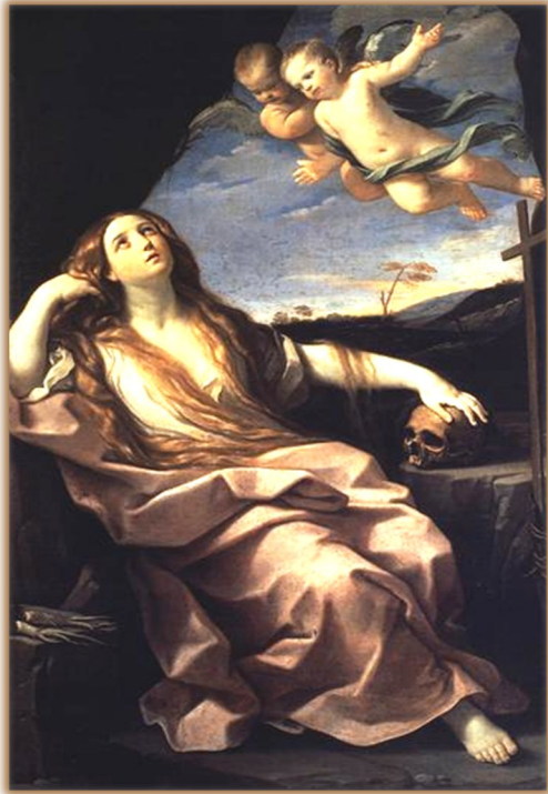
St. Mary Magdalene, Feast Day July 22 Guido Reni, 1632, oil on canvas

The Sixteenth Sunday in Ordinary Time † July 20, 2025