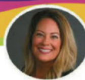
'REVOLVING CHOICES PLAYING ROULETTE WITH LIFE' EVIE WEST AUTHOR, PRO-LIFE SPEAKER, ADOPTION ADVOCATE