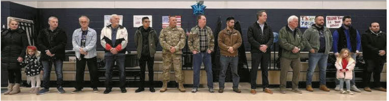
ICS honored our active and discharged military personnel last Wednesday in celebration of their duty to our country with a breakfast and flag ceremony as well as a tour of the school.