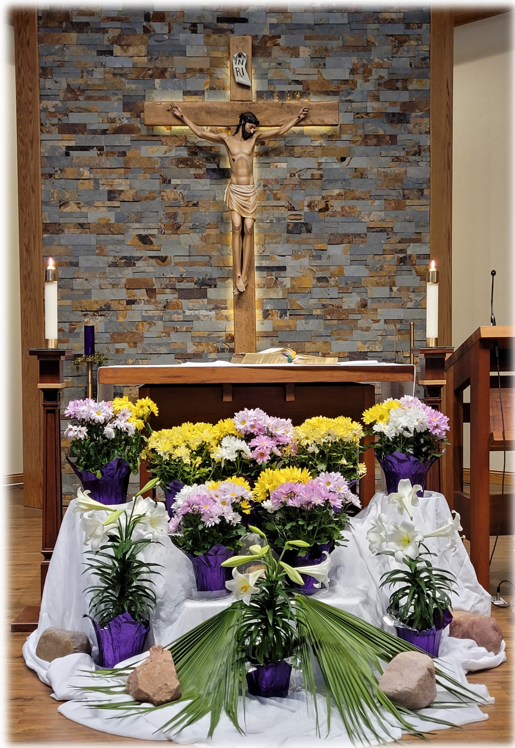
EASTER VIGIL AT ST. PETER, CAMERON

BARRON, CAMERON, CHETEK & STRICKLAND, WI