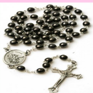
Altar & Rosary Society

Ladies, Mark your calendars: The next Altar and Rosary Society meeting for St. Peter will be on Thursday, March 9th, at 9:30am in the church hall. See you there! Thanks!