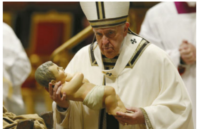
"There is no Christmas without the poor" Pope Francis

Christ is the Light shining in the darkness, for the whole world. The weary world, wounded by sin, can rejoice, for the Lord's message is truth for the world, and only "truth can set us free and draw us close to Christ."