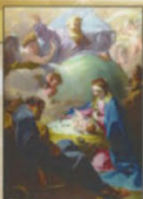
CC-01 Christmas Card Set

All this took place to fulfill what the Lord had said through the prophets: "Behold, the virgin shall be with child and bear a son, and they shall name him Emmanuel!" which means: "God is with us." - Isaiah 7:14