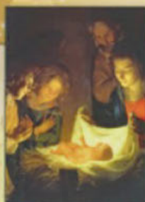
CC-02 Christmas Card Set

Attractive gift box of 12 cards with matching blank envelopes.