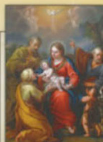
CC-05 Christmas Card Set

"Behold, I will come bearing gifts and frankincense, and kneeling adore the son of the Virgin." - Luke 1:33