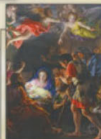
CC-06 Christmas Card Set

"And Mary kept all these things, reflecting on them in her heart." - Luke 2:19