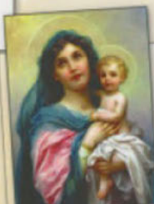
CC-04 Christmas Card Set

And this will be a sign for you: you will find an infant wrapped in swaddling clothes and lying in a manger. - Luke 2:12