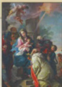
CC-03 Christmas Card Set

All this took place to fulfill what the Lord had said through the prophets: "Behold, the virgin shall be with child and bear a son, and they shall name him Emmanuel!" which means: "God is with us." - Isaiah 7:14