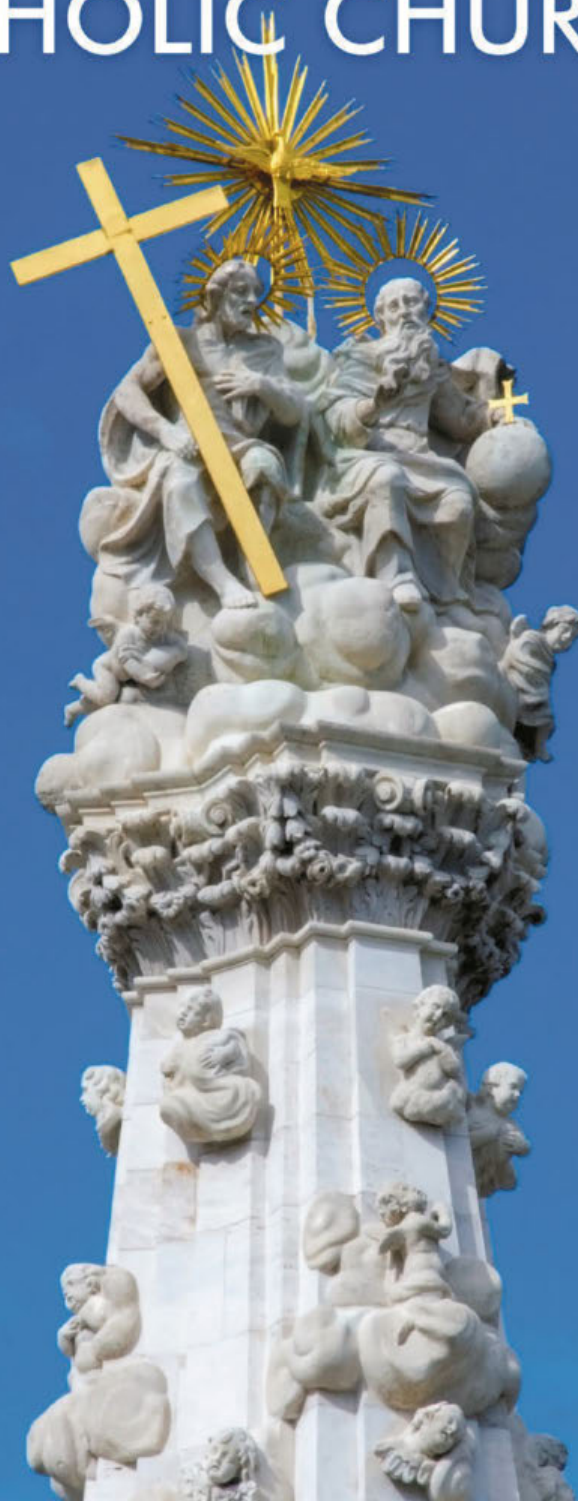
Holy Trinity Column Budapest, Hungary Built in 1713