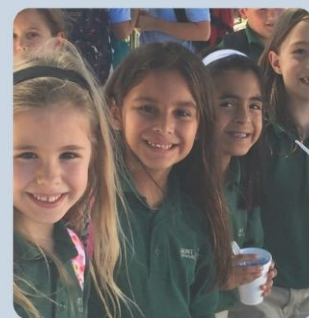
St. Timothy Catholic School Endowment Fund

ccfphx.org | 480-651-8805 | donorsupport@ccfphx.org