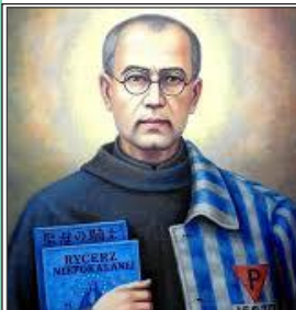
St. Maximilian Kolbe Memorial August 14th