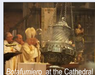
Botafumiero at the Cathedral