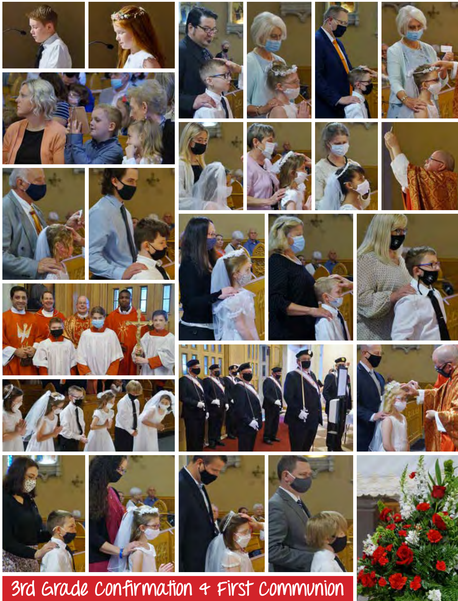
3rd Grade Confirmation & First Communion