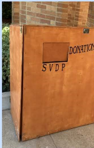
Donation box outside of church

@ St. Matthias Site – is still collecting food & personal goods. Donations can be placed in box outside of church.