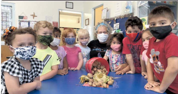
Preschoolers harvested potatoes and sunflowers from the St. Basil Pre-School garden! Stewards of the earth!