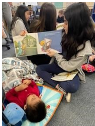
Reading Buddies continues to be a successful program!