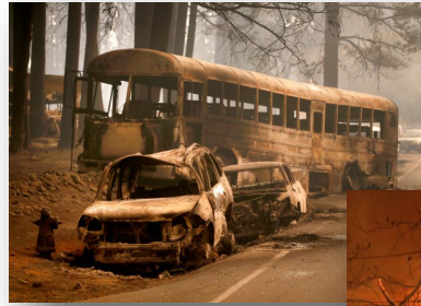
Photos of the Paradise, California fire posted to the internet.

Please check the website for items needed and tags will be put out on Dec. 1st and 2nd.